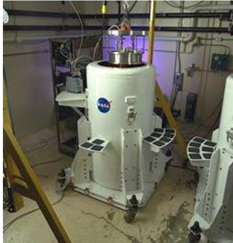
Photo: A typical modern flywheel doesn't even look like a wheel! It consists of a spinning carbon-fiber cylinder mounted inside a very sturdy container, which is designed to stop any high-speed fragments if the rotor should break. Flywheels like this have an electric motor and/or generator attached, which stores the energy in the wheel and gets it back again later when it's needed.