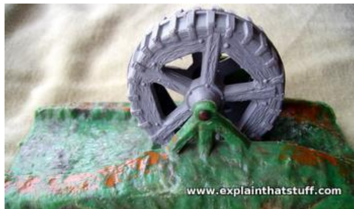
Photo: Water wheels use the simple flywheel principle to keep themselves spinning at a steady speed. This is a model of an undershot water wheel (one powered by a river flowing underneath).

You could argue that flywheels are among the oldest of inventions: the earliest wheels were made of heavy stone or solid wood and, because they had a high moment of inertia, worked like flywheels whether they were intended to or not. The potter's wheel (perhaps the oldest form of wheel in existence—even older than the wheels used in transportation) relies on its turntable being solid and heavy (or having a heavy rim), so it has a high moment of inertia that keeps it spinning all by itself while you shape the clay on top with your hands. Water wheels, which make power from rivers and creeks, are also designed like flywheels, with strong but light spokes and very heavy rims, so they keep on turning at a constant rate and powering mills at a steady speed. Water wheels like this became popular from Roman times onward.