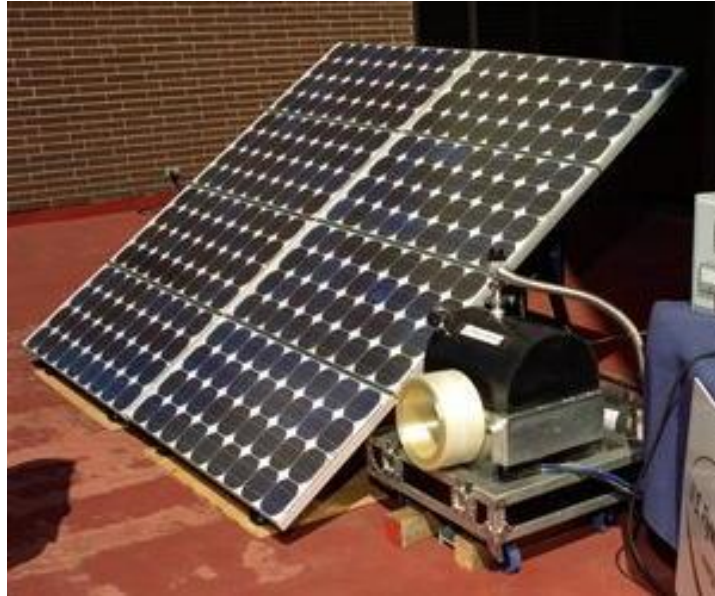
Photo: Flywheels make great alternatives to batteries. Here a flywheel (right) is being used to store electricity produced by a solar panel . The electricity from the panel drives an electric motor/generator that spins the flywheel up to speed. When the electricity is needed, the flywheel drives the generator and produces electricity again.