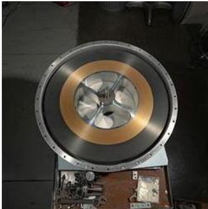
Photo: A modern flywheel developed by NASA for use in space. Note how the silver-colored center of the wheel is mostly empty space and spokes, while the mass of the wheel is concentrated around the rim. This gives the wheel what's known as a high moment of inertia (explained in more detail below) and allows it to store more energy

Stop... start... stop... start — it's no way to drive! Every time you slow down or stop a vehicle or machine, you waste the momentum it's built up beforehand, turning its kinetic energy (energy of movement) into heat energy in the brakes. Wouldn't it be better if you could somehow store that energy when you stopped and get it back again the next time you started up? That's one of the jobs that a flywheel can do for you. First used in potters wheels, then hugely popular in giant engines and machines during the Industrial Revolution, flywheels are now making a comeback in everything from buses and trains to race cars and power plants. Let's take a closer look at how they work!